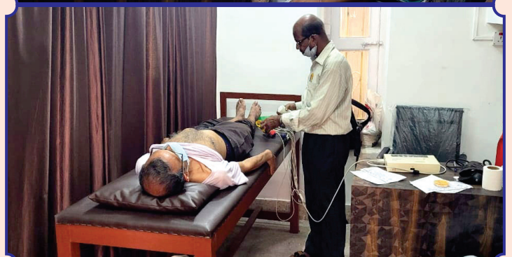
Project Ujjiwan : Sunday Medical Clinic